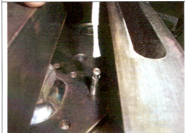
照片 "C" (破壞模式)