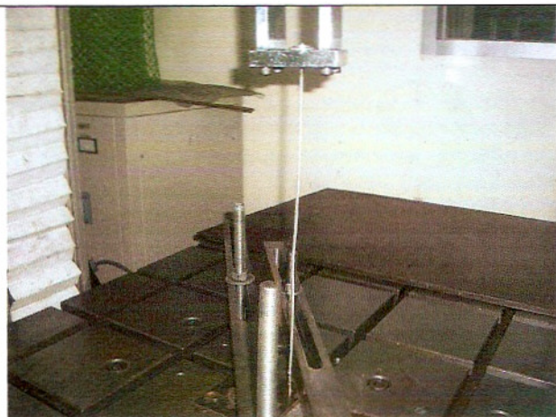
照片 "B" (測試方法)